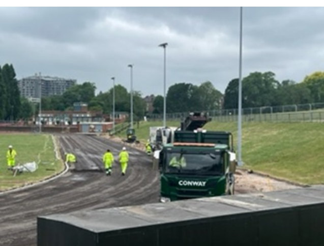
<u>Surface Degradation / Delamination Issues:</u>