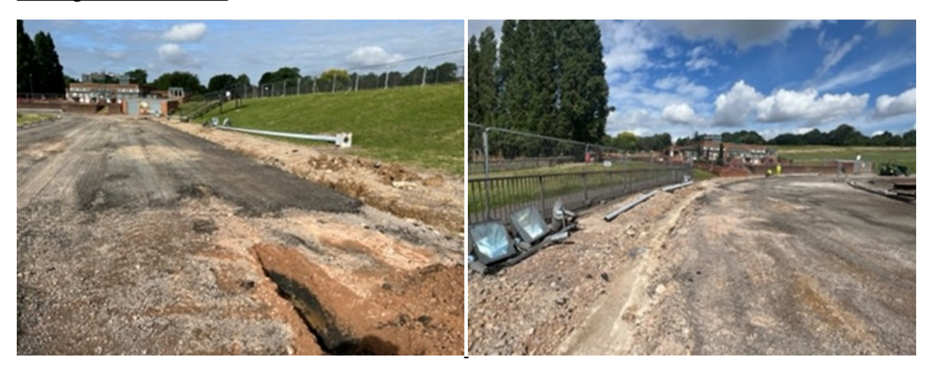
<u>Track Reconstruction Works:</u>